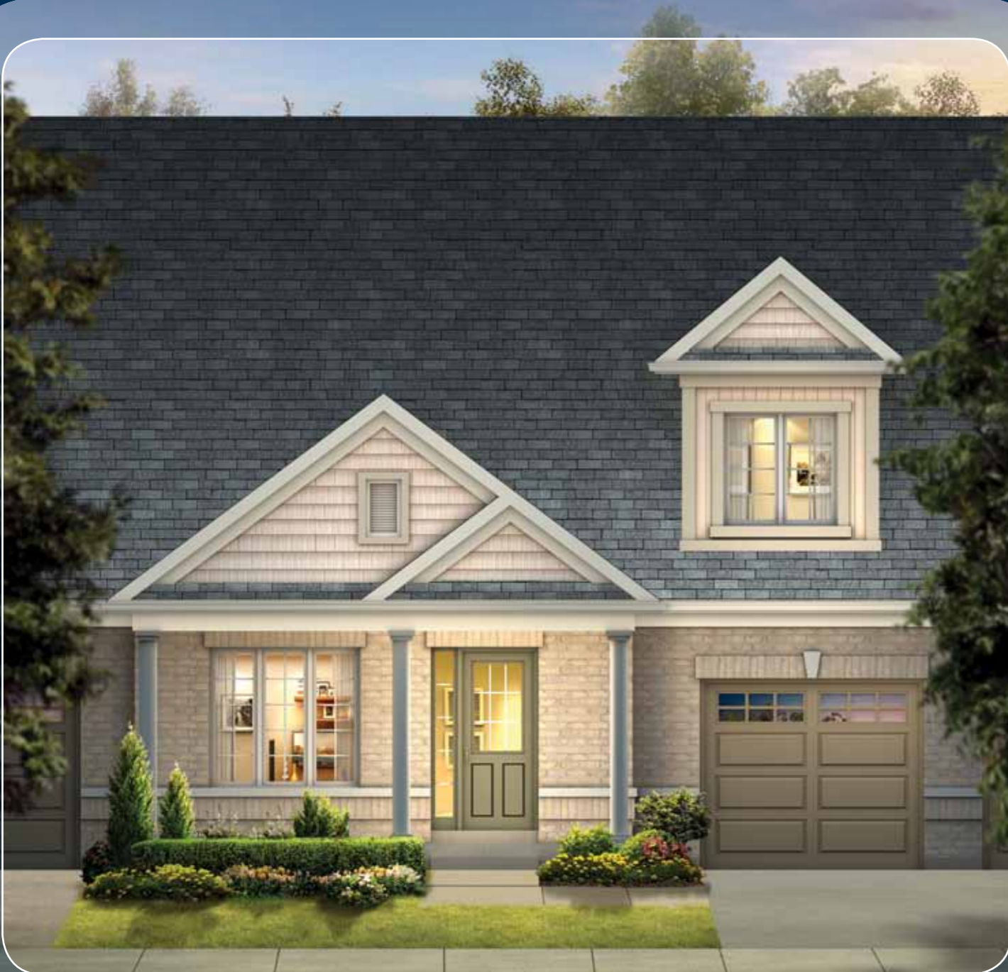
Elev. A - INTERIOR