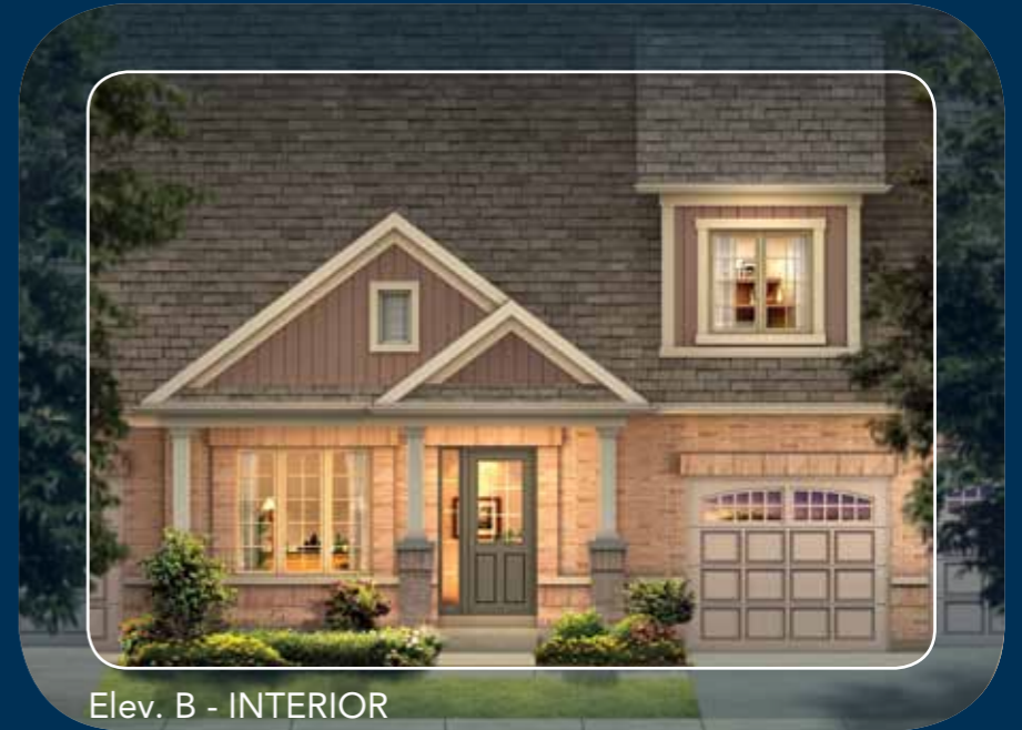
Elev. B - INTERIOR